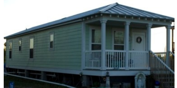
Photo: Cottages are modular homes, built to withstand 150-MPH winds and can be elevated up to 10 feet.

Read more about the cottage agreement here .