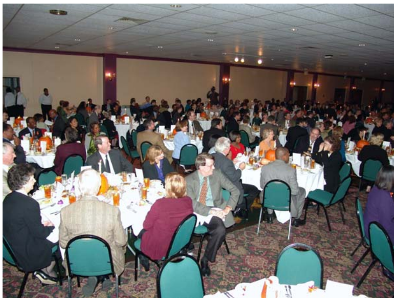
Over 300 MCJ Supporters share in the celebration at Mikhail's Northgate

If one word can capture the feeling of MCJ's second annual Champions of Justice Dinner on November 12, it would be "momentum." The campaign to make Mississippi the social justice state is on the move.